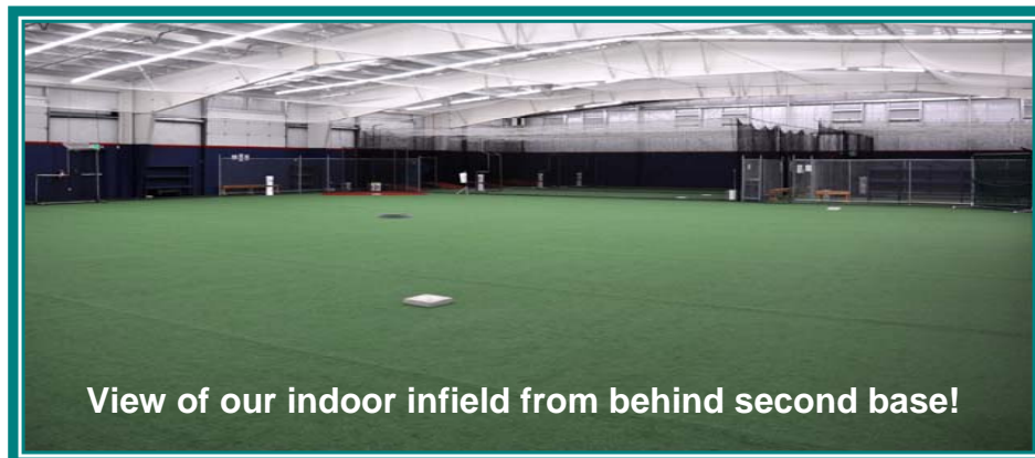
View of our indoor infield from behind second base!

The Bulldog Baseball Club was the first in the area to offer INDOOR SPRING TRAINING at the former Bulldog Baseball Training facility in Kent. We continue to offer the BEST instruction, now even better, in the ONLY TRAINING CENTER with a FULLY NETTED INFIELD and no posts.